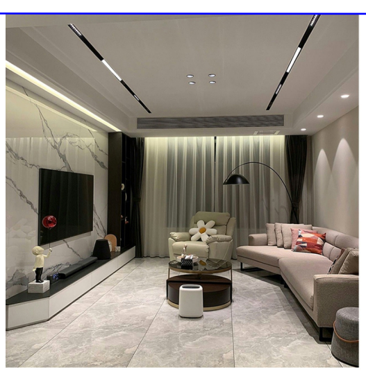
Rounded Square Shape